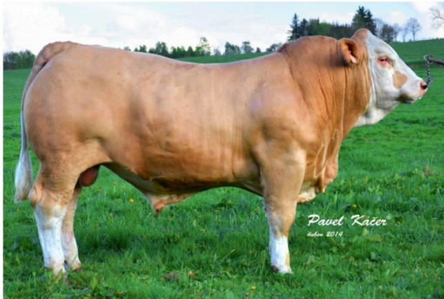
ZENTRUM, sire of CRISOL